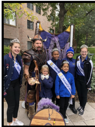
The Robbinsdale Whiz Bang Royal Court stopped by the Harvest Fest and posed with "Don the Viking"