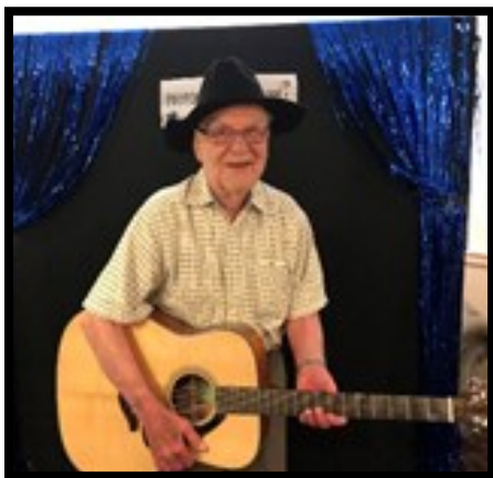
National Assisted Living Week! Residents enjoyed striking a pose at the Photo Booth!