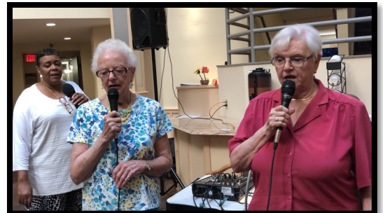
Karaoke contestants in the Manor