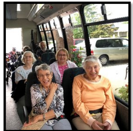
Lodge Residents are off to Culver's